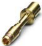
Crimp contact, turned, Single contact, contact diameter: 2 mm, crimp range: 0.25 mm 2 ... 1 mm 2