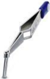
Positioning and unlocking tool for RC crimp contacts (D-SUB) for pin/socket, diameter: 2 mm

Please be informed that the data shown in this PDF Document is generated from our Online Catalog. Please find the complete data in the user's documentation. Our General Terms of Use for Downloads are valid ( http://phoenixcontact.com/download )