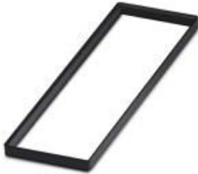
Replacement seal for size 2 sleeve

Please be informed that the data shown in this PDF Document is generated from our Online Catalog. Please find the complete data in the user's documentation. Our General Terms of Use for Downloads are valid ( http://phoenixcontact.com/download )