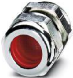
Cable gland, shielded: yes, cable diameter range: 9 mm ... 13 mm

Please be informed that the data shown in this PDF Document is generated from our Online Catalog. Please find the complete data in the user's documentation. Our General Terms of Use for Downloads are valid ( http://phoenixcontact.com/download )