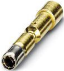
Crimp contact, Wire spring, Single contact, contact diameter: 1 mm, crimp range: 0.14 mm 2 ... 1 mm 2

Please be informed that the data shown in this PDF Document is generated from our Online Catalog. Please find the complete data in the user's documentation. Our General Terms of Use for Downloads are valid ( http://phoenixcontact.com/download )