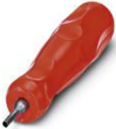
Positioning and unlocking tool for RC crimp contacts for pin/socket with metal clip, diameter 1.0 ... 1.5 mm

Please be informed that the data shown in this PDF Document is generated from our Online Catalog. Please find the complete data in the user's documentation. Our General Terms of Use for Downloads are valid ( http://phoenixcontact.com/download )