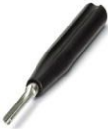
Positioning and contact removal tool for RC crimp contacts for pin / socket, diameter 1 mm

Please be informed that the data shown in this PDF Document is generated from our Online Catalog. Please find the complete data in the user's documentation. Our General Terms of Use for Downloads are valid ( http://phoenixcontact.com/download )