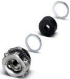
Cable gland, shielded: no, cable diameter range: 7 mm ... 10 mm

Please be informed that the data shown in this PDF Document is generated from our Online Catalog. Please find the complete data in the user's documentation. Our General Terms of Use for Downloads are valid ( http://phoenixcontact.com/download )