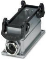
Box mounting base, with double locking latch, height 67 mm, with screw connection, 2x M25

Please be informed that the data shown in this PDF Document is generated from our Online Catalog. Please find the complete data in the user's documentation. Our General Terms of Use for Downloads are valid ( http://phoenixcontact.com/download )