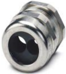
Special cable screw connection M25, brass nickel-plated, grommet with 10 mm and 11 mm holes

Please be informed that the data shown in this PDF Document is generated from our Online Catalog. Please find the complete data in the user's documentation. Our General Terms of Use for Downloads are valid ( http://phoenixcontact.com/download )