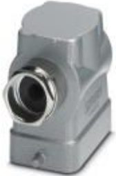
HEAVYCON B6 sleeve housing, for single locking latch, height: 72 mm, with 1 x Pg21 screw connection, lateral cable outlet

Please be informed that the data shown in this PDF Document is generated from our Online Catalog. Please find the complete data in the user's documentation. Our General Terms of Use for Downloads are valid ( http://phoenixcontact.com/download )