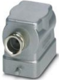
HEAVYCON B6 sleeve housing, for single locking latch, height: 56 mm, with 1 x M20 screw connection, lateral cable outlet

Please be informed that the data shown in this PDF Document is generated from our Online Catalog. Please find the complete data in the user's documentation. Our General Terms of Use for Downloads are valid ( http://phoenixcontact.com/download )