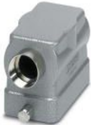
HEAVYCON B6 sleeve housing, for single locking latch, height: 56 mm, with 1 x M25 gland, lateral cable outlet

Please be informed that the data shown in this PDF Document is generated from our Online Catalog. Please find the complete data in the user's documentation. Our General Terms of Use for Downloads are valid ( http://phoenixcontact.com/download )