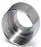
Step-up adapter, M20 to M25, including O-ring

Extension adapter - ENLAR-M-KV-M20/M25 - 1647666