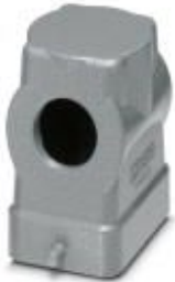
HEAVYCON B6 sleeve housing, for single locking latch, height: 72 mm, with 1 x M20 thread, lateral cable outlet

Please be informed that the data shown in this PDF Document is generated from our Online Catalog. Please find the complete data in the user's documentation. Our General Terms of Use for Downloads are valid ( http://phoenixcontact.com/download )