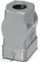
HEAVYCON B6 sleeve housing, for single locking latch, height: 72 mm, with 1 x M20 thread, straight cable outlet

Please be informed that the data shown in this PDF Document is generated from our Online Catalog. Please find the complete data in the user's documentation. Our General Terms of Use for Downloads are valid ( http://phoenixcontact.com/download )