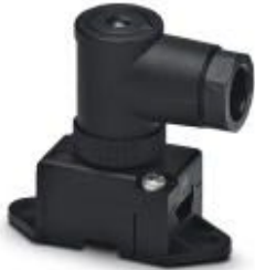
AS-Interface distributor with IP67 protection for 1 flat-ribbon conductor, 2-pos., with screw connection, angled

Please be informed that the data shown in this PDF Document is generated from our Online Catalog. Please find the complete data in the user's documentation. Our General Terms of Use for Downloads are valid ( http://phoenixcontact.com/download )