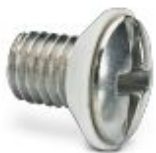
Sealing screw, size: Countersunk head, IP67, replacement part for D7 size HEAVYCON housing

Sealing screw - HC-D 7-DS-IP65 - 1686229