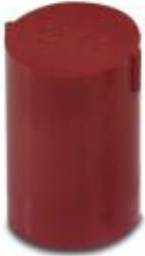
Closing cap, material: PA, color: red

Please be informed that the data shown in this PDF Document is generated from our Online Catalog. Please find the complete data in the user's documentation. Our General Terms of Use for Downloads are valid ( http://phoenixcontact.com/download )