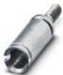
Coding socket for coding up to 16 connectors, for HC Modular