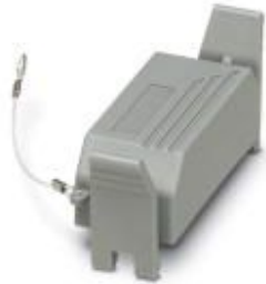
IP67 protective cover

Please be informed that the data shown in this PDF Document is generated from our Online Catalog. Please find the complete data in the user's documentation. Our General Terms of Use for Downloads are valid ( http://phoenixcontact.com/download )