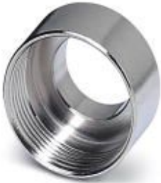
Extension adapter, material: Brass, nickel-plated, connecting thread: Pg21, color: silver

Please be informed that the data shown in this PDF Document is generated from our Online Catalog. Please find the complete data in the user's documentation. Our General Terms of Use for Downloads are valid ( http://phoenixcontact.com/download )