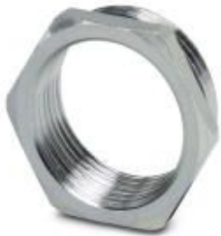
Reducing adapter, material: Brass, nickel-plated, connecting thread: Pg29, color: silver, with O-ring

Please be informed that the data shown in this PDF Document is generated from our Online Catalog. Please find the complete data in the user's documentation. Our General Terms of Use for Downloads are valid ( http://phoenixcontact.com/download )