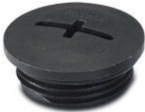
Screw plug, material: PA, connecting thread: M20 x 1.5, color: jet black RAL 9005, with O-ring

Please be informed that the data shown in this PDF Document is generated from our Online Catalog. Please find the complete data in the user's documentation. Our General Terms of Use for Downloads are valid ( http://phoenixcontact.com/download )