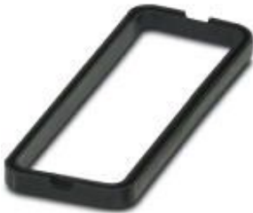
Replacement profile gasket, for HC-EVO-D25.....BK housing

Please be informed that the data shown in this PDF Document is generated from our Online Catalog. Please find the complete data in the user's documentation. Our General Terms of Use for Downloads are valid ( http://phoenixcontact.com/download )