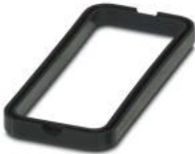
Replacement profile gasket, for HC-EVO-D15.....BK housing

Please be informed that the data shown in this PDF Document is generated from our Online Catalog. Please find the complete data in the user's documentation. Our General Terms of Use for Downloads are valid ( http://phoenixcontact.com/download )