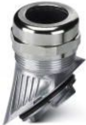
EVO metal cable gland with bayonet locking; size M40, for 4 conductors with 10 mm cable diameter

Please be informed that the data shown in this PDF Document is generated from our Online Catalog. Please find the complete data in the user's documentation. Our General Terms of Use for Downloads are valid ( http://phoenixcontact.com/download )