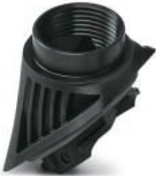
Adapter, plastic, for EVO housing, Pg21 thread

Please be informed that the data shown in this PDF Document is generated from our Online Catalog. Please find the complete data in the user's documentation. Our General Terms of Use for Downloads are valid ( http://phoenixcontact.com/download )