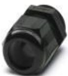
Cable gland, cable gland material: PA, external cable diameter 18 mm ... 25 mm, shielding: no, connecting thread: M32 x 1.5, color: jet black RAL 9005

Cable gland - G-INS-M32-L68N-PNES-BK - 1424483