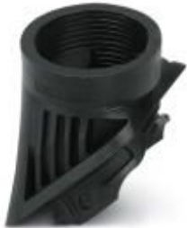
Adapter, plastic, for EVO housing, M32 thread

Please be informed that the data shown in this PDF Document is generated from our Online Catalog. Please find the complete data in the user's documentation. Our General Terms of Use for Downloads are valid ( http://phoenixcontact.com/download )