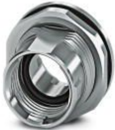
Housing screw connection, Socket, M12-SPEEDCON, Rear mounting, M15 x 1

Please be informed that the data shown in this PDF Document is generated from our Online Catalog. Please find the complete data in the user's documentation. Our General Terms of Use for Downloads are valid ( http://phoenixcontact.com/download )