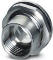
Housing screw connection, Socket, M12, Rear mounting, M15 x 1

Please be informed that the data shown in this PDF Document is generated from our Online Catalog. Please find the complete data in the user's documentation. Our General Terms of Use for Downloads are valid ( http://phoenixcontact.com/download )