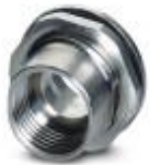
Sample set, Socket, M12, Rear mounting, M15 x 1

Sample set - SACC-BP-F-M12/M15-6-THR SP - 1421801