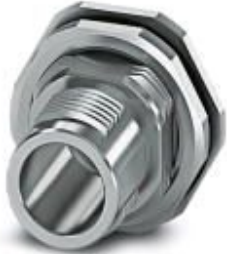
Housing screw connection, Plug, M12-SPEEDCON, Rear mounting, M15 x 1

Please be informed that the data shown in this PDF Document is generated from our Online Catalog. Please find the complete data in the user's documentation. Our General Terms of Use for Downloads are valid ( http://phoenixcontact.com/download )