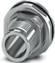
Housing screw connection, Plug, M12-SPEEDCON, Rear mounting, M15 x 1

Please be informed that the data shown in this PDF Document is generated from our Online Catalog. Please find the complete data in the user's documentation. Our General Terms of Use for Downloads are valid ( http://phoenixcontact.com/download )