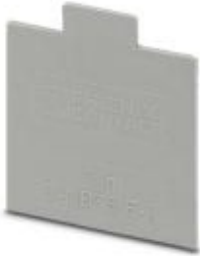
End cover, length: 28 mm, width: 1 mm, height: 30.3 mm, color: gray

Please be informed that the data shown in this PDF Document is generated from our Online Catalog. Please find the complete data in the user's documentation. Our General Terms of Use for Downloads are valid ( http://phoenixcontact.com/download )