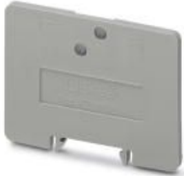
Partition plate, length: 42.5 mm, width: 2.5 mm, height: 30.5 mm, color: gray

Please be informed that the data shown in this PDF Document is generated from our Online Catalog. Please find the complete data in the user's documentation. Our General Terms of Use for Downloads are valid ( http://phoenixcontact.com/download )