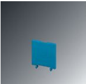
End cover, length: 28 mm, width: 2.5 mm, height: 30.2 mm, color: blue

Please be informed that the data shown in this PDF Document is generated from our Online Catalog. Please find the complete data in the user's documentation. Our General Terms of Use for Downloads are valid ( http://phoenixcontact.com/download )