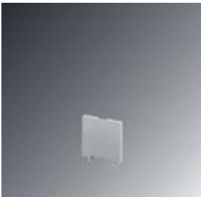
End cover, length: 28 mm, width: 2.5 mm, height: 30.2 mm, color: gray

Please be informed that the data shown in this PDF Document is generated from our Online Catalog. Please find the complete data in the user's documentation. Our General Terms of Use for Downloads are valid ( http://phoenixcontact.com/download )