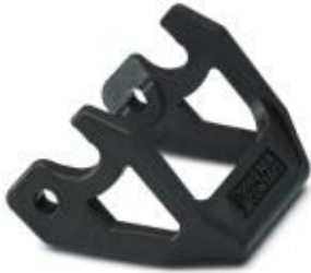
Double locking latch for B10 / B16 / B24 housing, HC-EVO....AL and HC-STA....AL

Please be informed that the data shown in this PDF Document is generated from our Online Catalog. Please find the complete data in the user's documentation. Our General Terms of Use for Downloads are valid ( http://phoenixcontact.com/download )