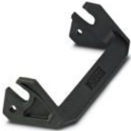
Single locking latch for B24 housing, HC-EVO....AL and HC-STA....AL

Please be informed that the data shown in this PDF Document is generated from our Online Catalog. Please find the complete data in the user's documentation. Our General Terms of Use for Downloads are valid ( http://phoenixcontact.com/download )