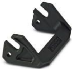
Single locking latch for B10 housing, HC-EVO....AL and HC-STA....AL

Please be informed that the data shown in this PDF Document is generated from our Online Catalog. Please find the complete data in the user's documentation. Our General Terms of Use for Downloads are valid ( http://phoenixcontact.com/download )