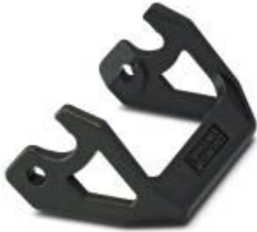
Single locking latch for B6 housing, HC-EVO....AL and HC-STA....AL

Please be informed that the data shown in this PDF Document is generated from our Online Catalog. Please find the complete data in the user's documentation. Our General Terms of Use for Downloads are valid ( http://phoenixcontact.com/download )