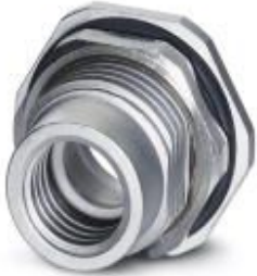
M8 socket, rear mounting

Please be informed that the data shown in this PDF Document is generated from our Online Catalog. Please find the complete data in the user's documentation. Our General Terms of Use for Downloads are valid ( http://phoenixcontact.com/download )