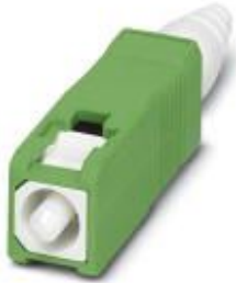
SC connector, with short bend protection (pigtail), for single mode 9/125 µm, APC polishing (8°), green

Please be informed that the data shown in this PDF Document is generated from our Online Catalog. Please find the complete data in the user's documentation. Our General Terms of Use for Downloads are valid ( http://phoenixcontact.com/download )