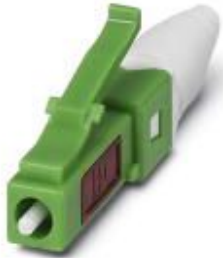
LC connector, with short bend protection (pigtail), for single mode 9/125 µm, APC polishing (8°), green

Please be informed that the data shown in this PDF Document is generated from our Online Catalog. Please find the complete data in the user's documentation. Our General Terms of Use for Downloads are valid ( http://phoenixcontact.com/download )