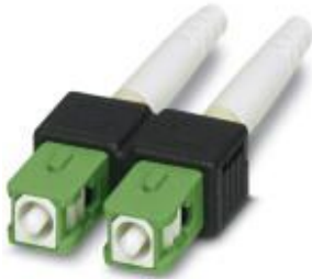
SC duplex connector, with long bend protection, for single mode 9/125 µm, APC polishing (8°), green

Please be informed that the data shown in this PDF Document is generated from our Online Catalog. Please find the complete data in the user's documentation. Our General Terms of Use for Downloads are valid ( http://phoenixcontact.com/download )