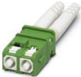
SC-RJ connector, with long bend protection, for single mode 9/125 µm, APC polishing (8°), green

Please be informed that the data shown in this PDF Document is generated from our Online Catalog. Please find the complete data in the user's documentation. Our General Terms of Use for Downloads are valid ( http://phoenixcontact.com/download )