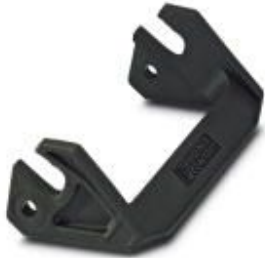
Single locking latch for B16 housing, HC-EVO....AL and HC-STA....AL

Please be informed that the data shown in this PDF Document is generated from our Online Catalog. Please find the complete data in the user's documentation. Our General Terms of Use for Downloads are valid ( http://phoenixcontact.com/download )