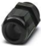
Cable gland, cable gland material: PA, external cable diameter 15 mm ... 21 mm, shielding: no, connecting thread: M32 x 1.5, color: jet black RAL 9005

Cable gland - G-INS-M32-M68N-PNES-BK - 1411136