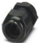
Cable gland, cable gland material: PA, external cable diameter 11 mm ... 17 mm, shielding: no, connecting thread: M25 x 1.5, color: jet black RAL 9005

Cable gland - G-INS-M25-M68N-PNES-BK - 1411134