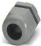
Cable gland, cable gland material: PA, external cable diameter 11 mm ... 17 mm, shielding: no, connecting thread: M25 x 1.5, color: silver-gray RAL 7001

Cable gland - G-INS-M25-M68N-PNES-GY - 1411126