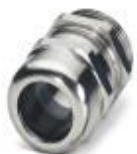
Cable gland, cable gland material: Nickel-plated brass, external cable diameter 11 mm ... 17 mm, shielding: no, connecting thread: M25 x 1.5, color: silver, with O-ring

Cable gland - G-INS-M25-M68N-NNES-S - 1411165