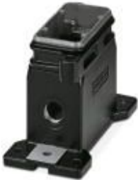
HEAVYCON B6 box mounting base, for screw locking, HPR series, with 2 x M20 gland, for increased environmental and EMC requirements

Please be informed that the data shown in this PDF Document is generated from our Online Catalog. Please find the complete data in the user's documentation. Our General Terms of Use for Downloads are valid ( http://phoenixcontact.com/download )