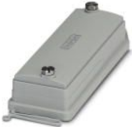
HEAVYCON ADVANCE, IP66, B24 protective cover for panel mounting side, with screw locking, with retaining cord, diameter of retaining cord eyelet: 3 mm

Please be informed that the data shown in this PDF Document is generated from our Online Catalog. Please find the complete data in the user's documentation. Our General Terms of Use for Downloads are valid ( http://phoenixcontact.com/download )